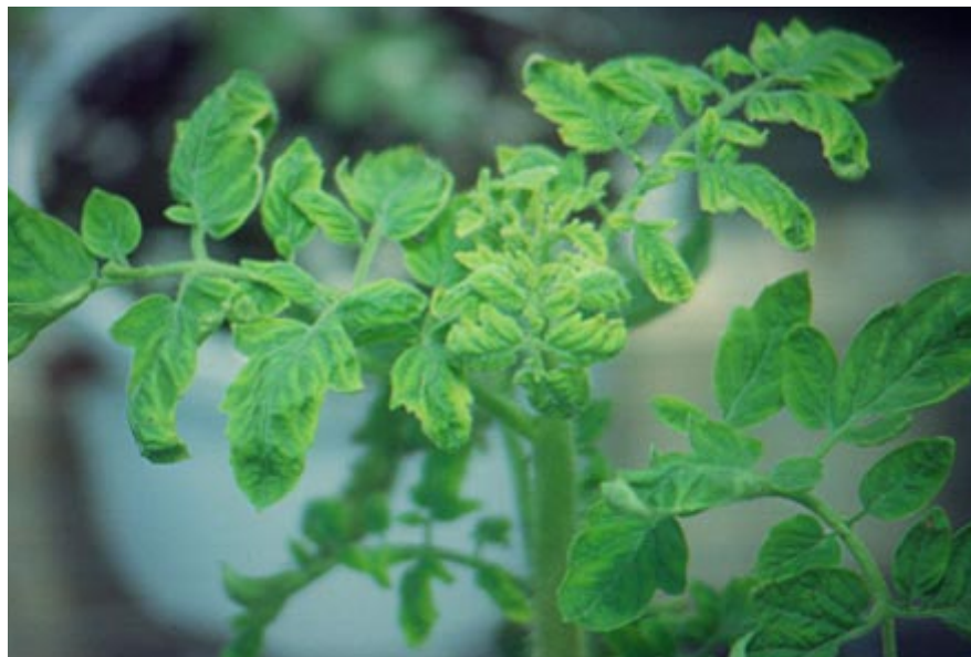
Fig. 1. Lycopersicon esculentum 'Better Bush Improved' infected with tomato yellow leaf curl virus (TYLCV-Is). Plant was purchased at a retail garden center in Sarasota, Florida, in July 1997.

It is likely that the virus entered Dade County sometime between fall and spring of the 1996-97 tomato production season. As temperatures increased, whiteflies, and probably the incidence of plants infected with TYLCV-Is, increased in abandoned tomato fields in February and March. It is common in Dade County to abandon tomato fields after harvesting and to disk under crop residue several weeks to months later. TYLCV-Is may have spread from these fields to the tomato plants in nearby greenhouses that were being produced for distribution to garden centers. Tomato plants are shipped year-round from Dade County to retail garden centers, and plants were shipped regularly throughout Florida until July 1997, when TYLCV-Is was detected. Three similar retail tomato production sites in Collier County were