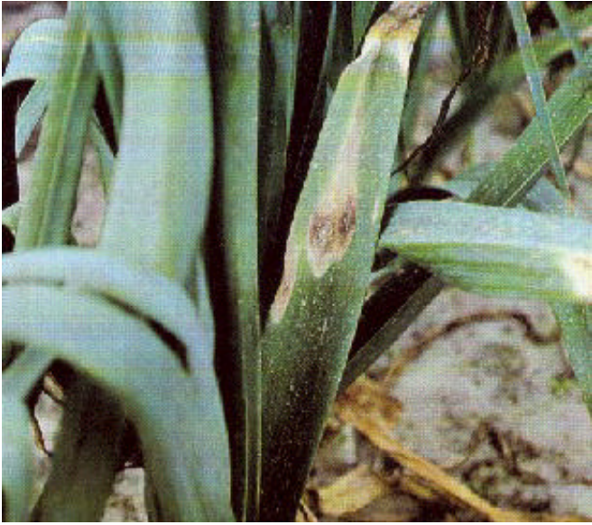
Figure 3. Purple blotch in leek.