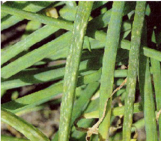
Figure 1. Lesions caused by Botrytis in onion leaves.

Control of PB includes rotating crops with nonsusceptible crops, accelerating decomposition of old onion debris in the field, destroying volunteers, and using healthy transplants. Spraying with labeled fungicides is often necessary. A sequence of spray treatments, delivered at five-to-seven day intervals, should be initiated when symptoms of PB first appear if leaf wetness periods exceed 11 hours. Spray intervals can be lengthened during extended dry periods, when leaf wetness lasts for less than nine hours. Thoroughly covering onion leaves with the spray is essential to achieve control. With proper use of nozzle arrangements and spreader-sticker adjuvants, excellent control of PB and BLB can be achieved.