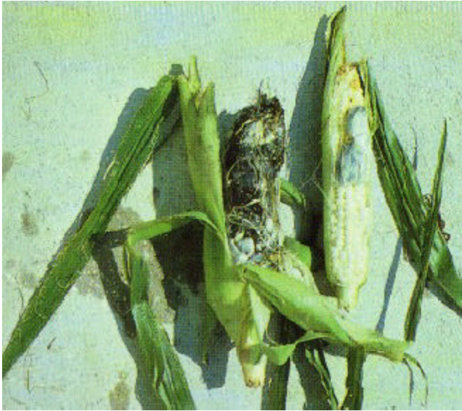
Figure 7. Corn smut on ears.