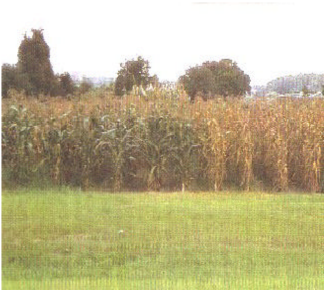
Figure 13. Susceptible vs resistant varieties to southern corn leaf blight.