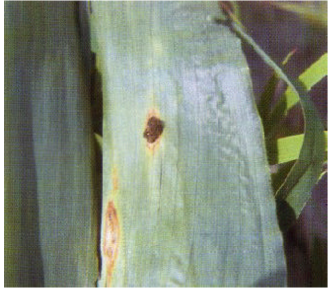
Figure 8. Corn smut on leaf.