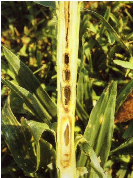
Figure 5. Bacterial stalk rot in corn.