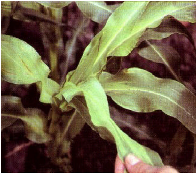
Figure 19. Sorghum downy mildew in corn.