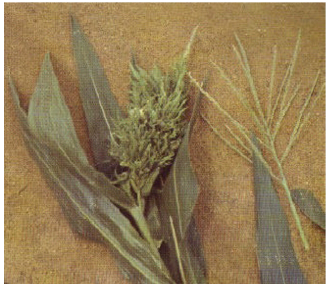
Figure 18. Crazy top (downy mildew) in corn.