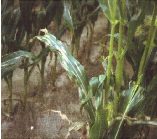
Figure 11. Northern corn leaf blight.