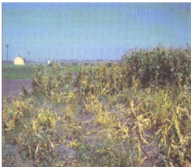
Figure 1. Most severe lodging where corn followed corn vs. corn followed by soybeans.

In south Florida, particularly Dade County, several viral diseases have occurred in seed production fields for field corn. Maize stripe virus (MSV), maize rayado fino virus (MRFV), and maize mosaic virus (MMV) have been identified. In addition, maize bushy stunt mycoplasma and corn stunt spiroplasma (CSS) have been identified. Symptoms of these diseases can be similar to those of MDMV and display chlorotic spots or stripes (Fig. 23). Stunting and leaf twisting may be present (Fig. 23). While MSV and MMV are spread by planthoppers, MRFV and CSS are spread by leafhoppers. Resistant inbreds and varieties should be used. Also, weed grasses (e.g., itch grass) in the vicinity should be minimized as they may serve as hosts for these organisms. Little is known about virus-corn interactions in Florida at this time.