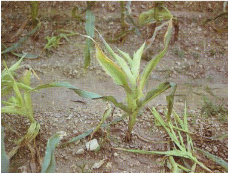
Figure 23. Complex of mixed viral infections in corn.