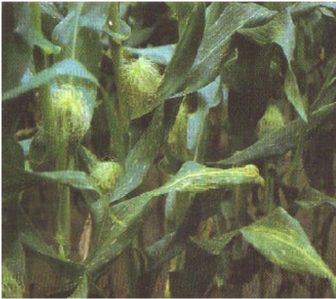
Figure 15. Southern corn leaf blight.