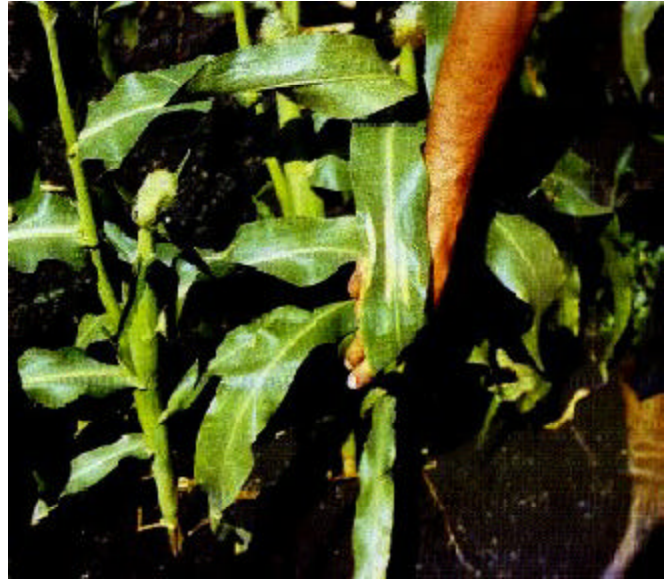
Figure 12. Northern corn leaf blight in bands.