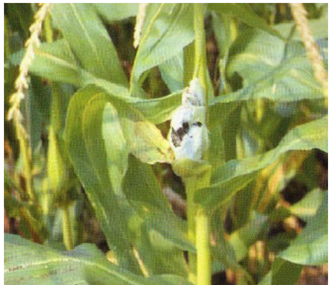
Figure 6. Corn smut on stalk.