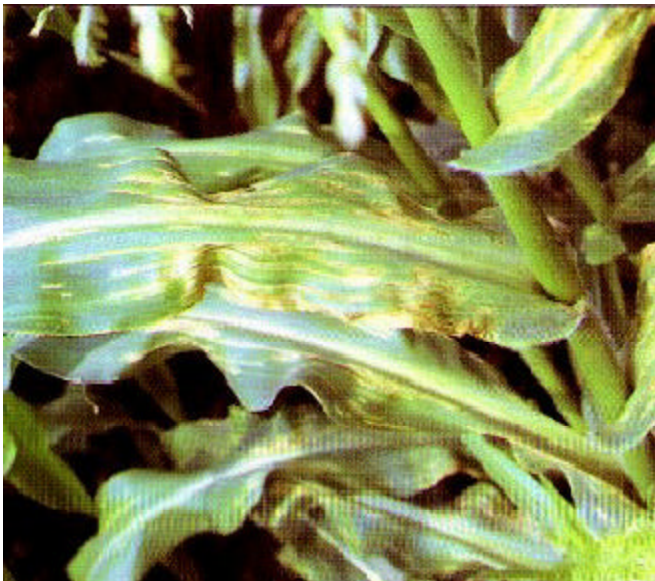
Figure 21. Bacterial leaf blight in corn.