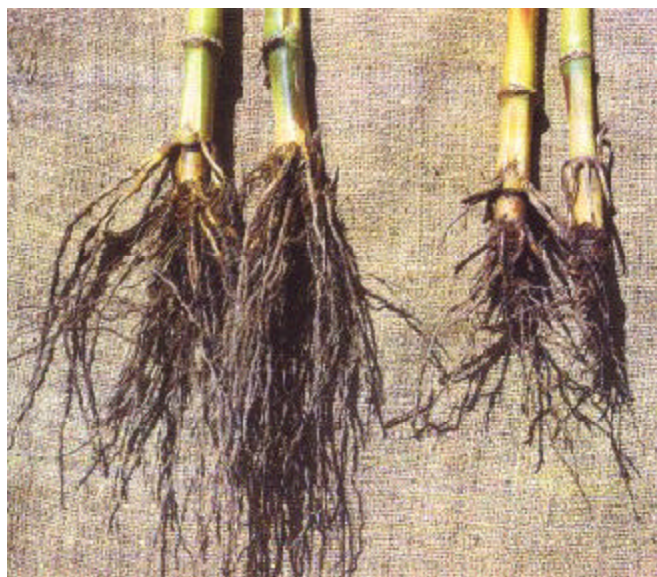
Figure 2. Most severe root rot where corn followed corn.