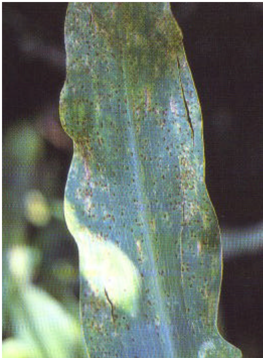
Figure 9. Common corn rust.