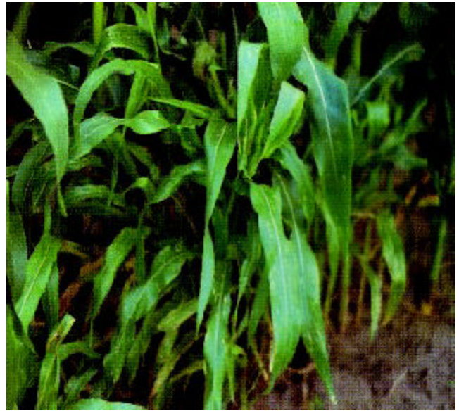
Figure 16. Southern corn leaf blight on volunteer corn.