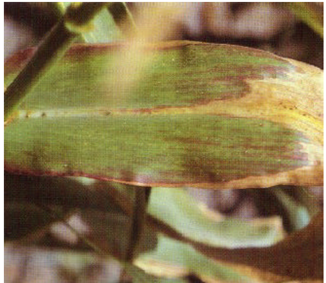
Figure 22. Maize dwarf mosaic virus infections in corn.