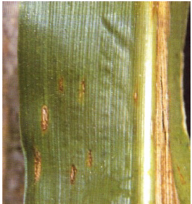
Figure 10. Southern corn rust.