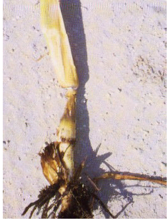
Figure 4. Bacterial stalk rot.