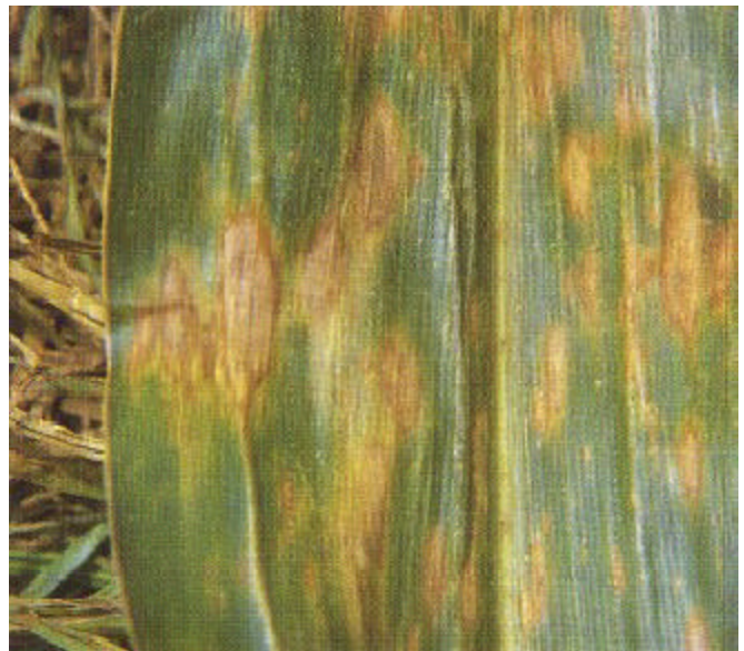
Figure 14. Southern corn leaf blight.