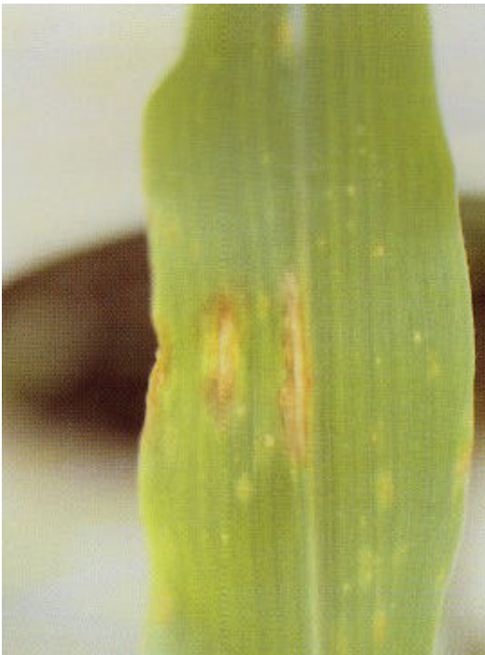
Figure 17. Leaf spot caused by Bipolaris zeicola .