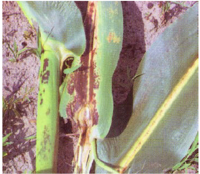
Figure 20. Brown spot in corn