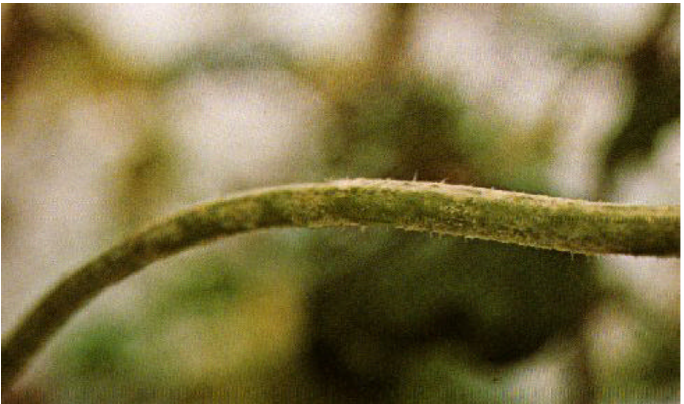
Figure 3. Powdery mildew on petiole (leaf stalk) of cucumber.