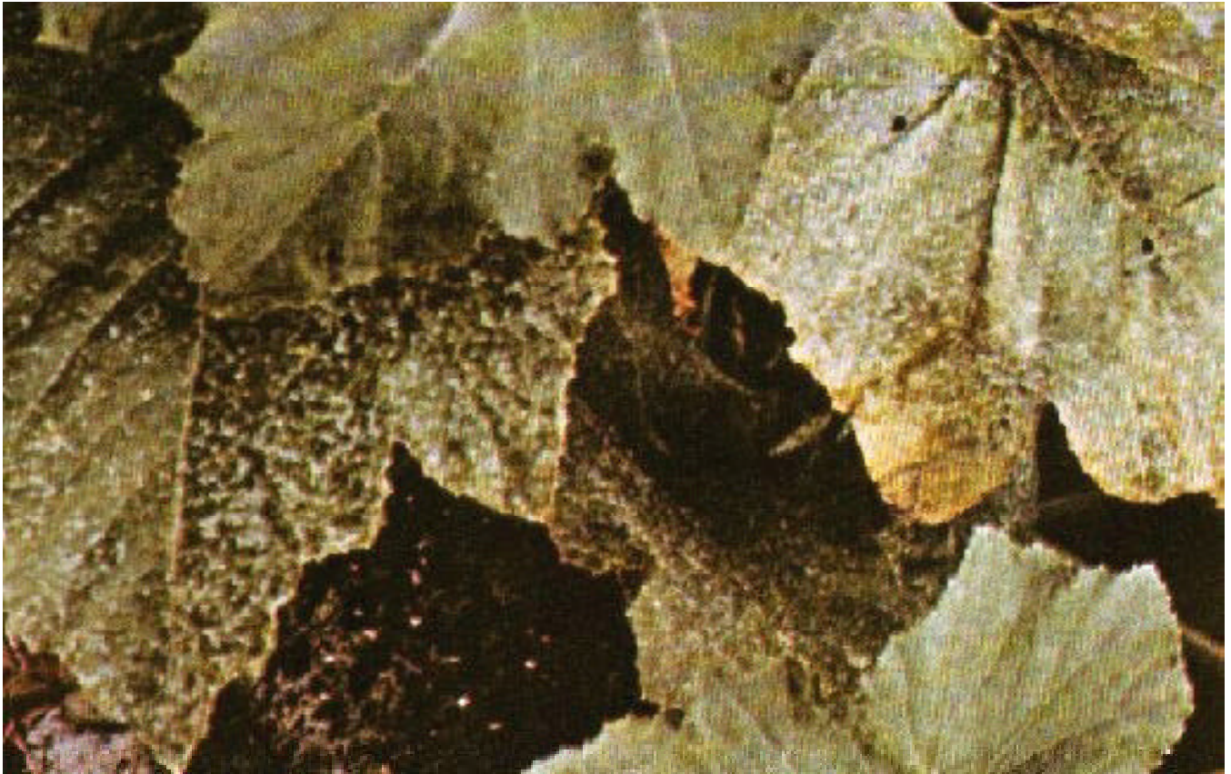
Figure 4. Squash leaves with various degrees of powdery mildew severity.