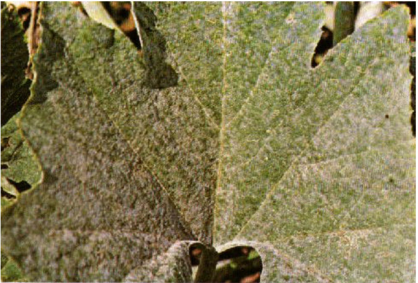
Figure 2. Advanced leaf symptoms of powdery mildew on yellow squash.