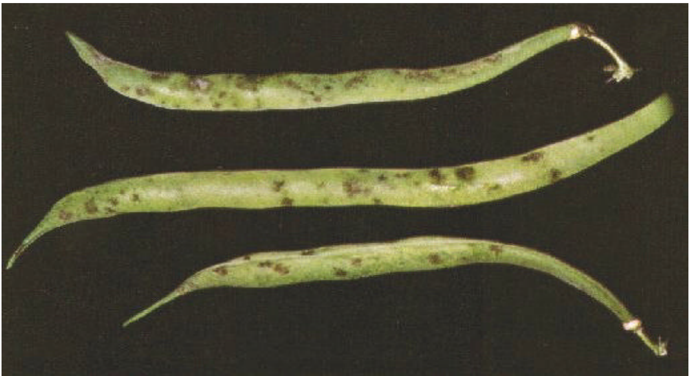
Figure 5. Powdery mildew on snap bean pods.