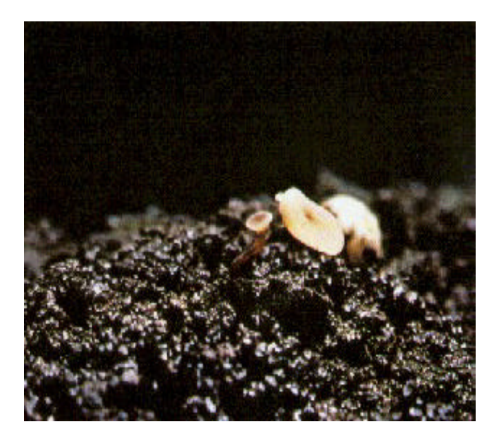
Figure 7. Mature apothecia (mushroom-like sporebearing structures) growing out of a Sclerotinia sclerotium.