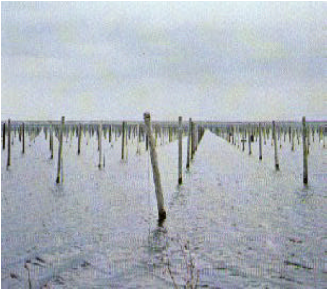
Figure 8. Flooding- a commoon practice for Sclerotinia control in celery fields.