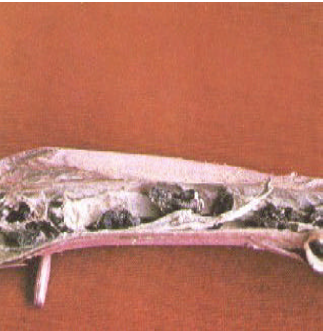
Figure 6. Black sclerotia inside tomato stem.