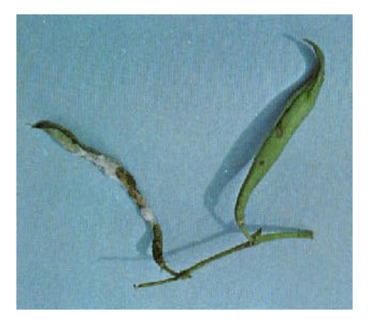
Figure 3. Sclerotinia infection of bean pods.