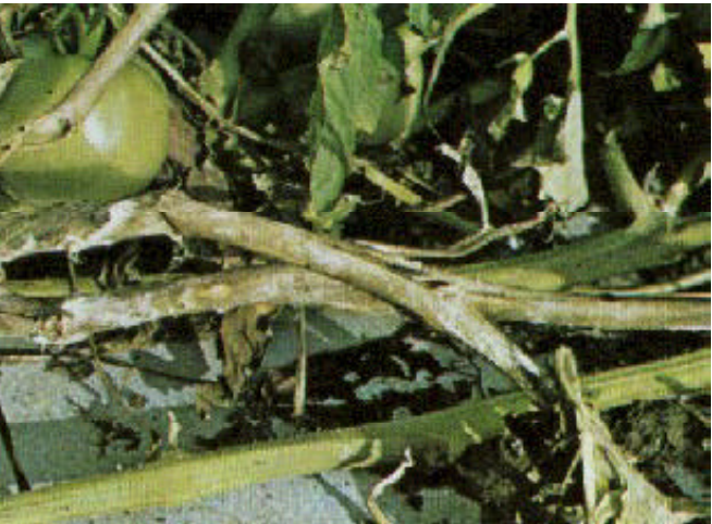
Figure 2. Cottony, white, fungus growth on tomato plant with Sclerotinia stem rot.