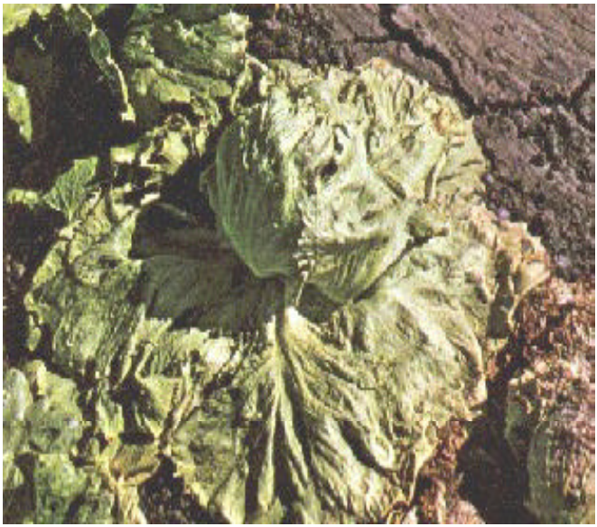
Figure 4. Lettuce drop, showing collapse of outer leaves.