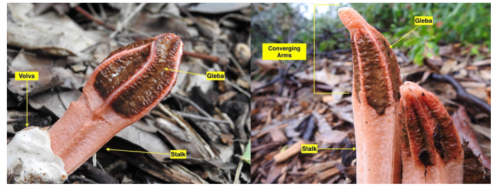
Figure 4. Lysurus mokusin (Lantern Stinkhorn) emerging from leaf litter. Left photo shows white volva; right photo shows pointed lantern shape of converging arms at the tip of the mushroom. This photo shows a specimen from Australia but the species has been introduced to the United States.

Lysurus mokusin in its egg stage is white in color and 0.4–1 inches (1–3 cm) in diameter. The stalk is spongy and hollow, and each mushroom can vary in color between white, pink, and red. The stalk is 4–6 inches (10–15 cm) tall and 0.6–1 inch (1.5–2.5 cm) wide. The stalk is indented by four to six grooves that run from the volva to the tip of the mushroom lengthwise. The stalk ends in an angular fusion of four to six arms that arise from the grooved indentations of the stalk in an apical lantern-like shape that is smooth and cylindrical at the tip (Gogoi and Parkash 2015). The converging arms of Lysurus mokusin contain a brown, slimy spore mass that smells like rotting flesh (Chen et al. 2014).