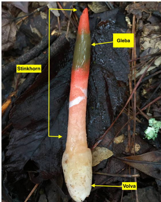
Figure 1. Mature stinkhorn Mutinus elegans (the Elegant Stinkhorn) in Cumming, Georgia.

The eggs of Mutinus elegans begin as small, white, egg-like balls, 0.5–1 inch (1.2–2.5 cm) in diameter. The stalk of Mutinus elegans is 4–7 inches (10–18 cm) tall, and 0.5–1 inch (1.2–2.5 cm) wide. The stalk is rough, tapered at both ends, hollow, spongy, and ranges in color from orange to pink-orange and pink-red. The volva (the sack at the base of the stalk) is whitish, tough, and wrinkled. The spore mass is olive green to dull green, slimy, foul-smelling, and covers the upper half or upper third of the stalk (Besette et al. 2007).